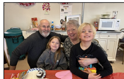
Photos from our Valentine party